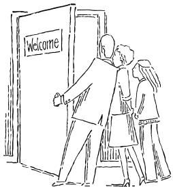
New Member Class

If you are interested in joining Redeemer, an information night will be held on Wednesday, May 4, at 7:00pm in the Manor House.