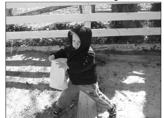
Sunday School Easter Egg Hunt